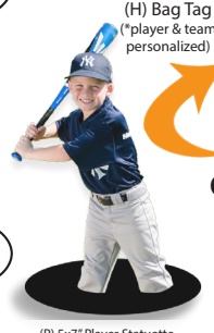
(H) Bag Tag (*player & team personalized)