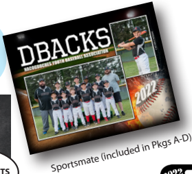
Sportsmate (included in Pkgs A-D)