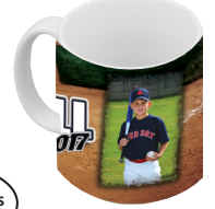
(L) Coffee Mug