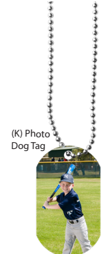
(K) Photo Dog Tag