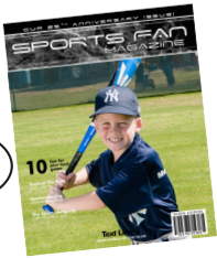
(N) 4x5" Magazine Cover Magnet